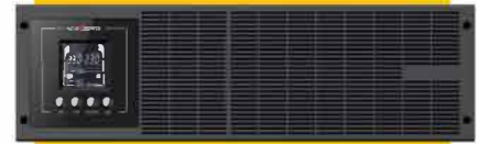
Cronus 6KR / 10KR (top)