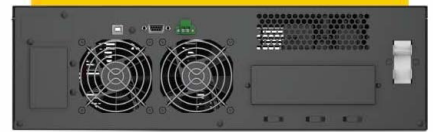
Rear Panel Cronus 6KR / 10KR (bottom)