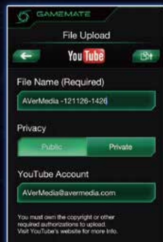
Easy Gameplay Sharing