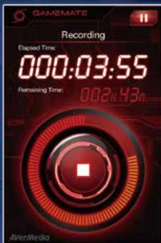
Working Status at a Glance